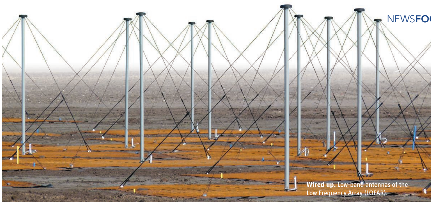
Wired up. Low-band antennas of the Low Frequency Array (LOFAR).