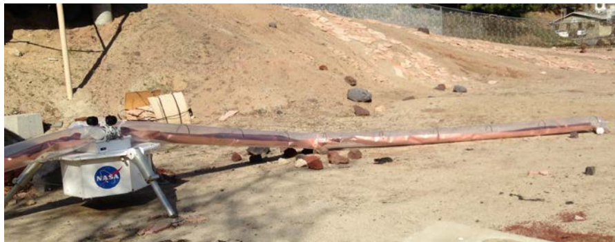
Proof-of-concept lunar surface antenna being deployed from a mock lander in the JPL Mars Yard. The antenna is encased in a plastic tube, which is being inflated to deploy the antenna. The approximate length of the arm is 10 meters.

Co-I Carilli continued work with ground-based low frequency interferometers to study the cosmological signal from neutral hydrogen in the early Universe. This work is key preparatory work for a future low frequency radio telescope on the Moon, informing both the science and the techniques. These studies have the potential to become the 'richest of all cosmological data sets', with an impact on cosmology and studies of galaxy formation comparable to that of the discovery of the Cosmic Microwave Background.